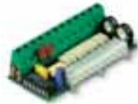
PIU expansion card for control unit Pc/pack 1