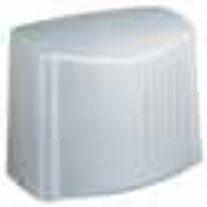
THA1 die-cast aluminium casing