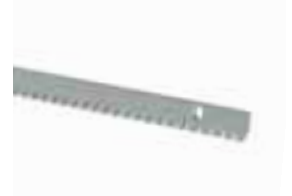
ROA8 M4 rack, 30x8x1000mm, zinc coated with spacers and screws Pc/pack 10