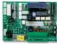
THA5 spare control unit, only card, for TH1551