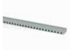
ROA7 M4 rack, zinc coated, 22x22x1000mm Pc/pack 10