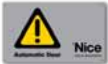
TS signboard Pc/pack 1

Nice recommends customers order products in pallets in order to facilitate storage and delivery, and ensure packs are uniform. The number of packs per single pallet has been specified for this reason.